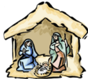
The Gift that Changed the World

So wrap our injured flesh around you, breathe our air and walk our sod. Rob our sin and make us holy, perfect Son of God. Perfect Son of God. Welcome to our world.