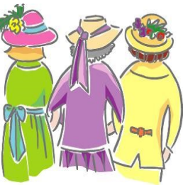
Mothers & Daughters

Our annual Mother-Daughter Banquet will be on Sunday, May 15th, at 5:00 pm in the Family Life Center. Invite your family and friends for an evening of fun and fellowship. Bring your favorite salads, finger foods, or dessert. We will be collecting items for the Community Pregnancy Center of Lake Norman. They are in need of diapers (no new born), boy clothing (newborn to 18 month), sleepers, onesies up to 24 months, boys shoes, socks, and bibs, Johnson and Johnson baby wash, shampoo and lotions, crib sheets, unscented baby wipes (Parents choice at Wal-Mart and Up and Up at Target), and any summer maternity clothes. We hope to see you there! Women of the Church