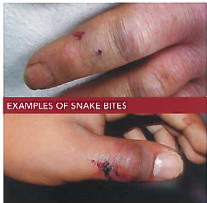
EXAMPLES OF SNAKE BITES

If a snakebite victim is having chest pain, difficulty breathing, face swelling or has lost consciousness, call 9-1-1 immediately.