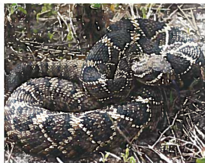
eastern diamondback rattlesnake

As your Session we always welcome comments. Grace and Peace, Dale Burgess - Clerk of Session